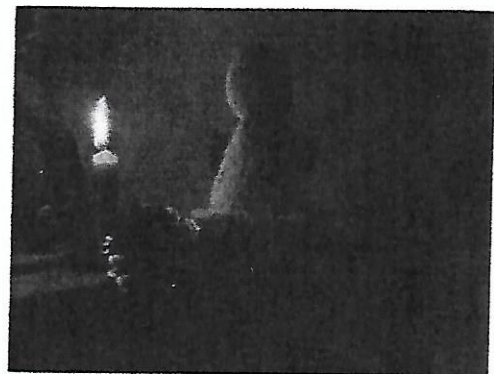
This angel is knitted in sparkly cream, with sparkly mohair wings.